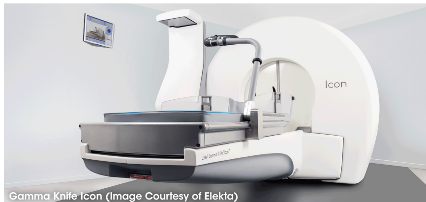
Gamma Knife Icon

SPECIALIZED CARE FOR BRAIN METASTASES AT THE PRINCESS MARGARET PAGE 1