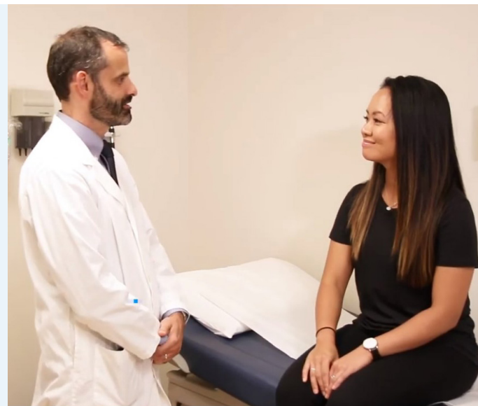
Photograph taken before the COVID-19 pandemic.

Any questions regarding referrals can be directed to our referral coordinators (listed on page 4). For more information, please see our Referral Process Guide .