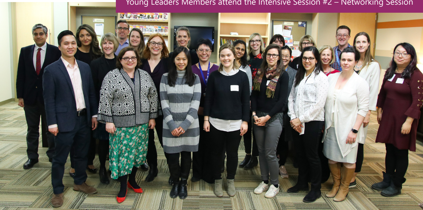
Young Leaders Members attend the Intensive Session #2 – Networking Session

Members do not have to graduate the program once they are 40 years old. Members elect to graduate when they feel they are ready