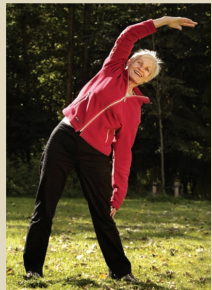
Exercise and proper nutrition are effective in preventing heart problems.

Cardiac Rehabilitation (CR) is an individualized, outpatient chronic disease management program that is designed to help patients live a healthier life while reducing their risk of another heart event (i.e., heart attack or stroke). CR professionals ensure patients reap all the benefits of modern medicine (i.e., medications and tests), along with the simple, and proven basics – diet and exercise. Dietitians develop a nutrition plan, that increases the intake of vegetables and fruits, and reduces salt. Exercise physiologists work with patients to develop personalized "exercise prescriptions" that are tailored to each patient's fitness level.