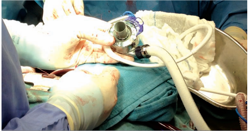
An example of the mechanical heart that was implanted on Marcel’s left ventricle.

When one considers the sobering statistics about heart failure in Canada, Marcel’s chances of finding a new heart were dim. Every year in Canada, more than 50,000 people are diagnosed with heart failure. Of those, 2,000 have advanced heart failure. There are approximately 200 heart transplants