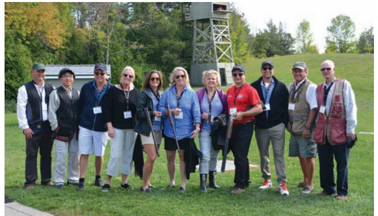
With instruction from Caledon Mountain Trout Club members, guests and docs enjoy the experience of the shooting range.