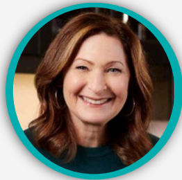
Anna Maria Tremonti Public Forum Panel Moderator