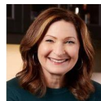
Anna Maria Tremonti Journalist, Public Forum Panel Moderator Canada