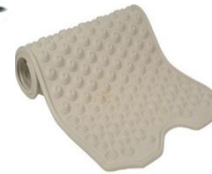
No-slip bath mat