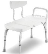
Bath transfer bench