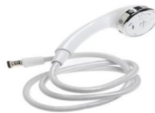
Hand-held shower head