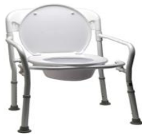
Raised toilet seat or commode

Here are examples of additional equipment that you may want to rent/purchase to improve your comfort and make your household activities easier: