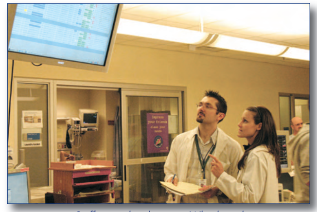
Staff using the electronic Whiteboard

Our Lean initiatives focus on some of the most pressing issues in patient care, streamlining care delivery processes to improve patient access and decrease wait times. Over the past two years, UHN has implemented several clinical change management projects with a specific focus on improving patient flow through the Emergency, General Internal Medicine (GIM), Surgical Services, Palliative Care and Medical Imaging departments.