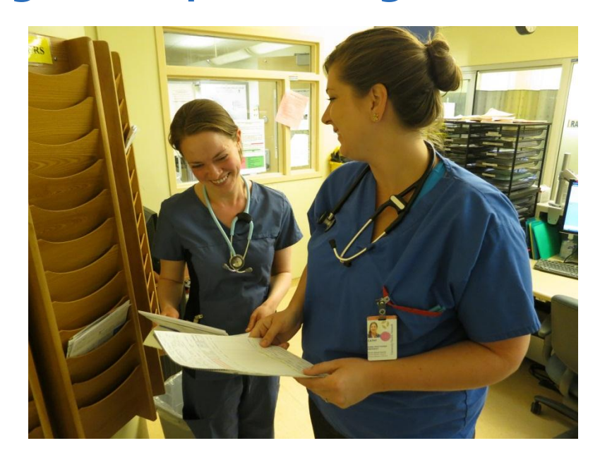
Nursing staff in the Toronto General Emergency Department.

The survey also provided the first official insight into the satisfaction of Toronto Rehab staff post-integration. On average, the Toronto Rehab scores were equivalent to the rest of UHN.