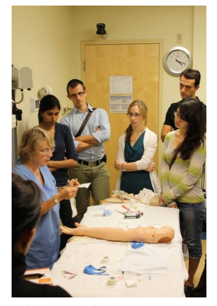
Third year U of T medical students learn IV skills.

Medical students at the Wightman-Berris Academy are now getting more exposure to the continuum of care since Toronto Rehab