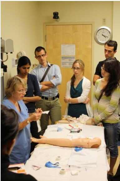
Third year U of T medical students learn IV skills.

Medical students at the Wightman-Berris Academy are now getting more exposure to the continuum of care since Toronto Rehab became an official member after it integrated with UHN in July 2011.