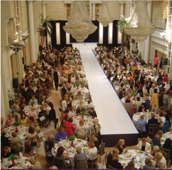
St. Regis Room Fashion Show.