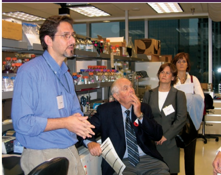
Members of the WB Family Foundation on a tour of the Beamish Centre for Convergence.