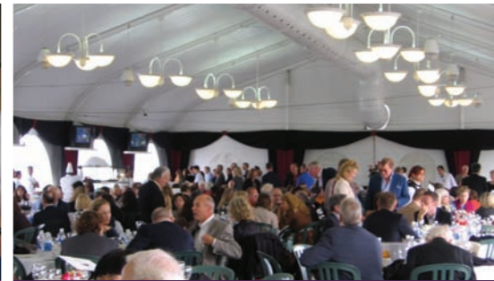
Day at the Races.