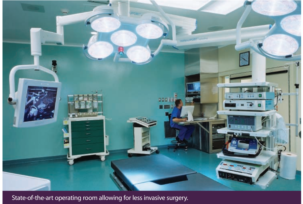
State-of-the-art operating room allowing for less invasive surgery.