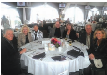
Guests at Day at the Races 2010.