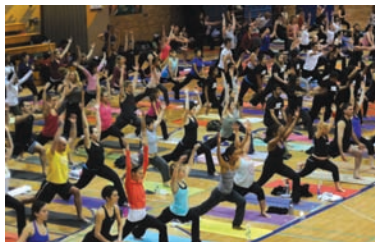
Power of Movement; the yoga challenge to beat arthritis.