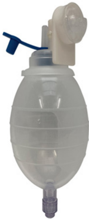
P-Eggy™ chest drain valve

This brochure tells you what you need to know about having a chest drain valve.